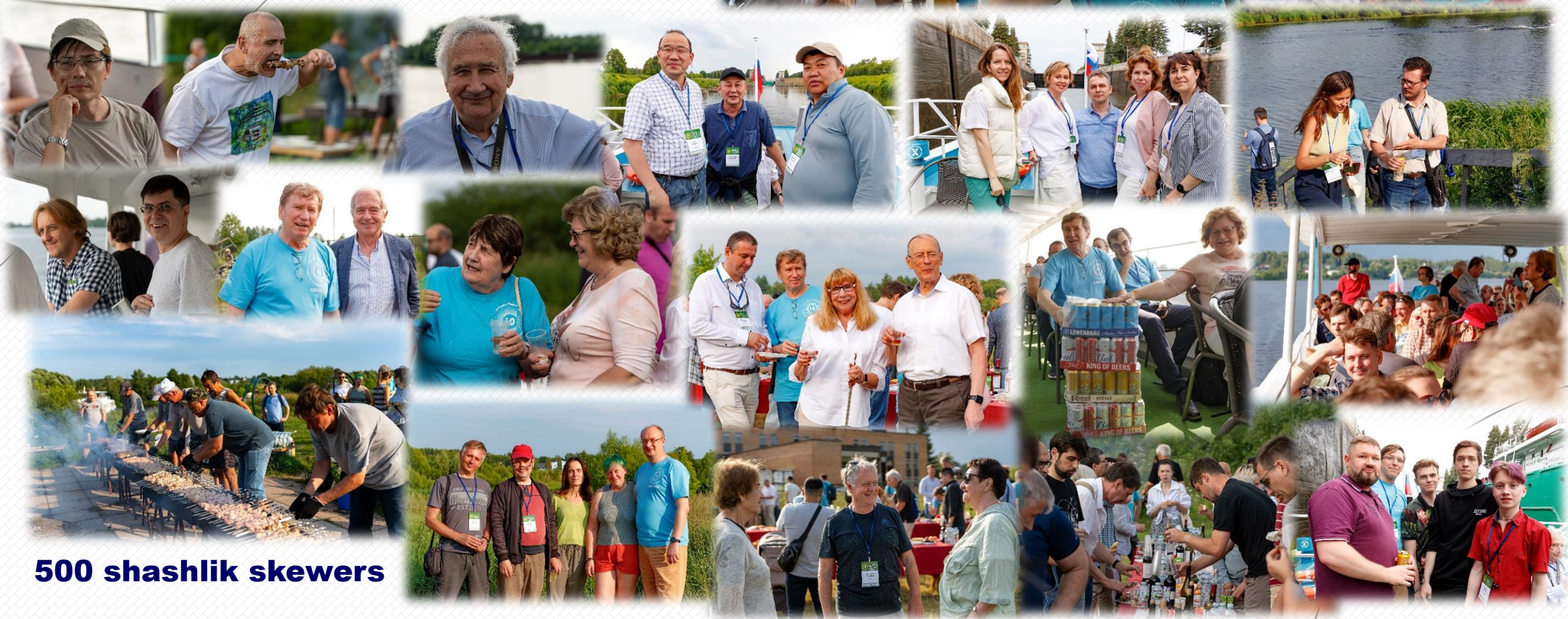
500 shashlik skewers